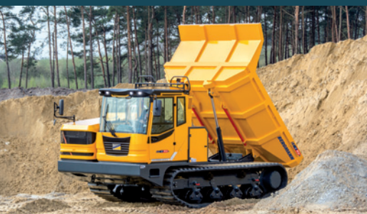
C912s | Rear tip dumper