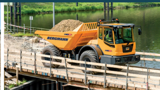
C815s | Swivel tip dumper