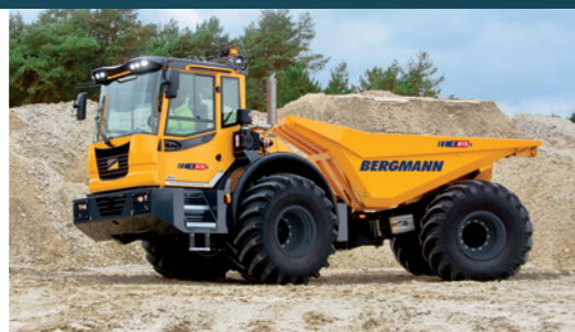
C815s | Rear tip dumper