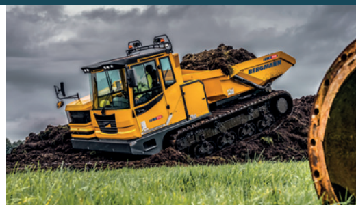
C912s | Swivel tip dumper