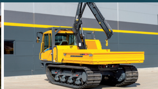
C912s | Carrier vehicle