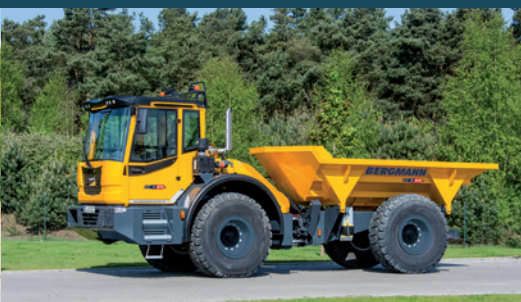
C815s | Three-way tip dumper