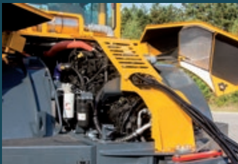
Good access to all maintenance points with the patented hood system.