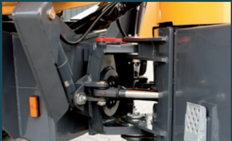
Articulated swivel joint with stabilization cylinder.