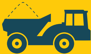
Conventional compact tipper