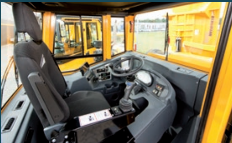
Cabin with optional swivel console and intuitive operability.